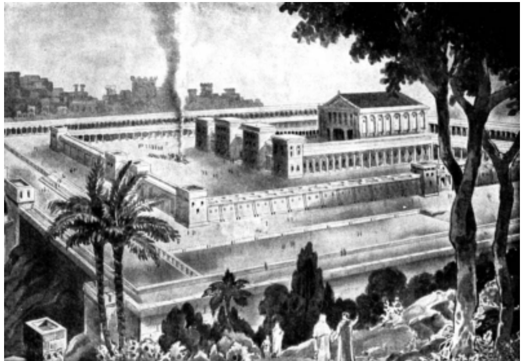
Jesus and the disciples stood on the Mount of Olives looking down on the temple.

"Do you see all these buildings? I tell you the