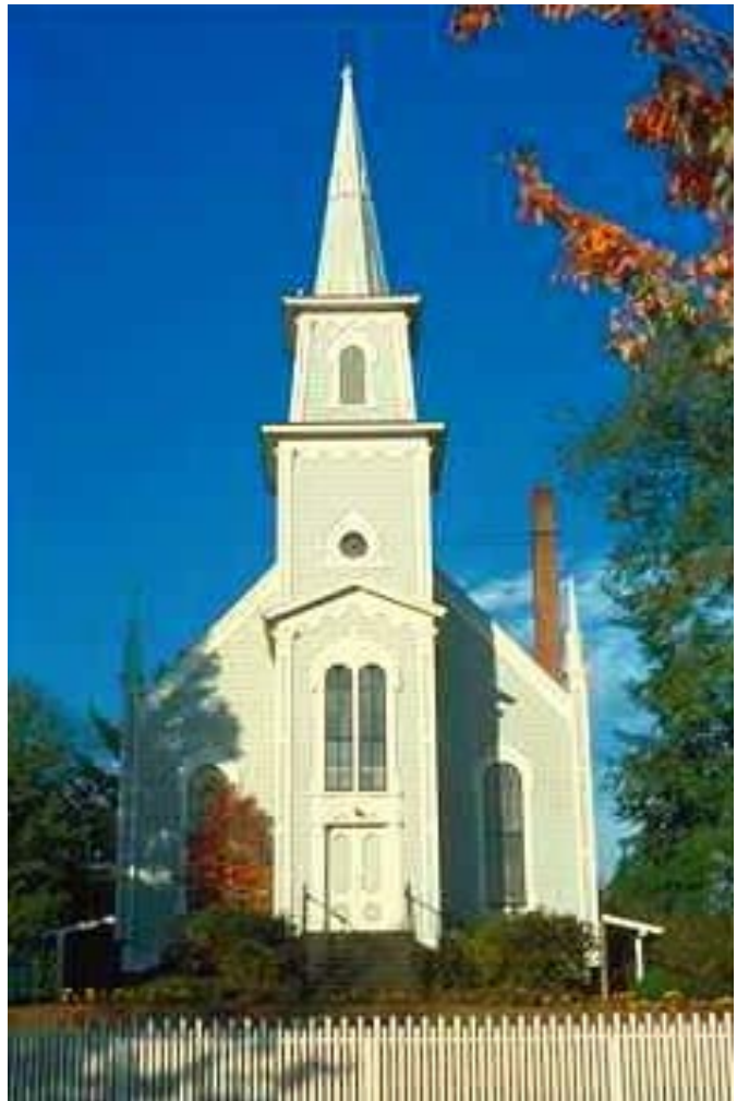
Is it possible that people who claim to represent Christ are really Satan’s “ministers,” his servants, used by the devil to spread deception?

Satan never presents sin as it really is. He never