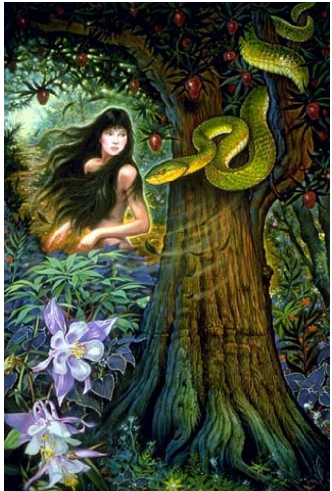
Satan, appearing as a serpent, came privately to Eve and subtly contradicted what God had told her and her husband.

The story begins with the very origins of humankind. As stated in the book of Genesis, God created