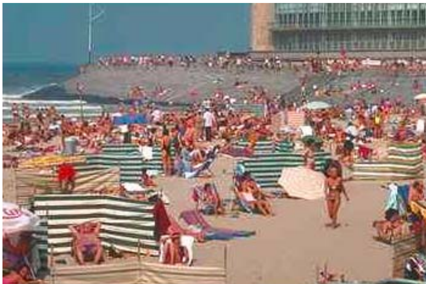
Under Satan's influence, millions of people often spend the Sabbath in pursuit of their own interests rather than in seeking God, regardless of which day they perceive the Sabbath to be. God intends that humanity enjoy all that has been provided in the world, but with God's way, man's priorities are rearranged.

In a sense, his immediate goal—keeping mankind separate from God—is relatively easy. As humans we are naturally inclined to focus on our own selfish wants. As Paul puts it, “those who live according to the sinful nature have their minds set on what that nature desires” (Romans 8:5, NIV). Those whose minds are focused on themselves are, whether they realize it or not, “hostile to God” (verse 7, NIV).